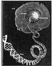
The study indicates that stuttering in the family clusters tested is caused by a gene that resides on chromosome 18.

possible for stuttering. These types of studies can lead to the ultimate identification of the variant gene itself, which would be a great advance in our understanding of the causes of stuttering. On a more general level, it adds yet another piece of evidence that inherited factors can be important in stuttering."